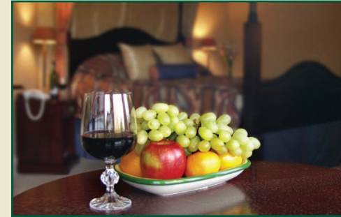
Bedroom - The Green Hotel