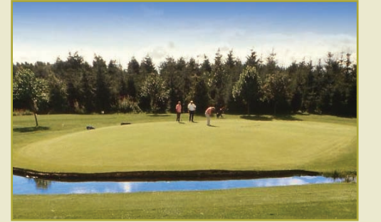
Golf Course - The Montgomery 6th

Cross the Kincardine Bridge (A876) and then take the A977 until the M90 motorway - cross straight over. Take first exit on left – Springfield Road. "T" junction, turn Right. The Green Hotel is on the right and The Windlestrae on the left.