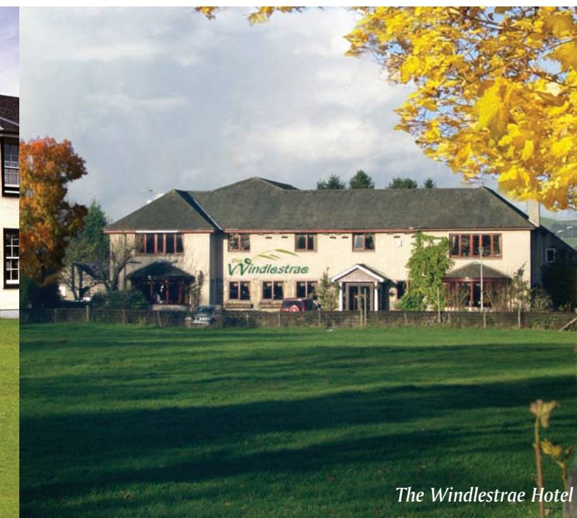
The Windlestrae Hotel