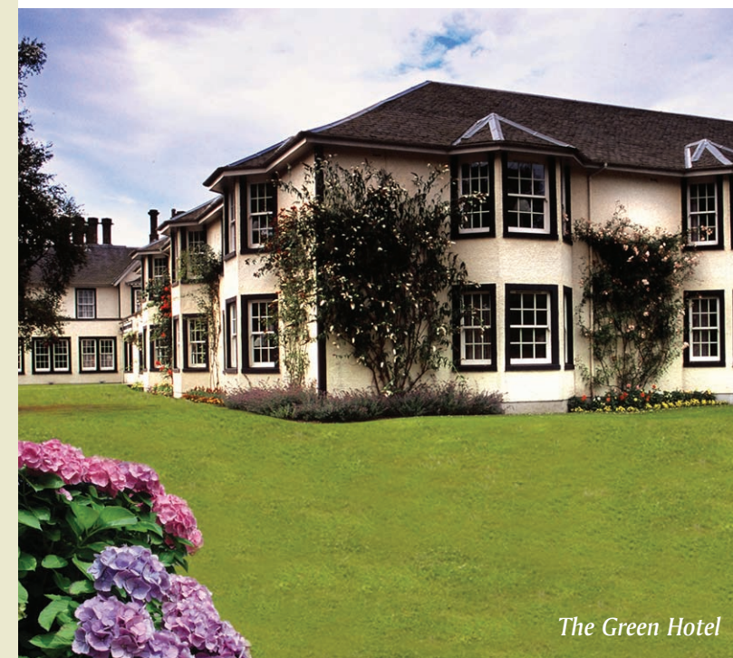
The Green Hotel