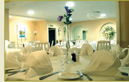
Restaurant - The Green Hotel

There are 46 double and twin-bedded rooms at The Green Hotel and 45 at The Windlestrae. With so much to do at the hotel, you may not want to spend much time in your bedroom while you are here, but if you do – they're all equipped with hospitality tray, direct dial telephone, trouser press, hairdryer, television and wireless internet access.