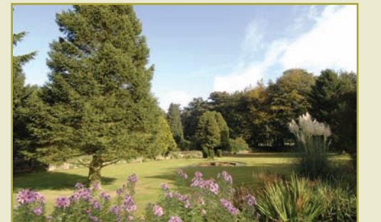
Gardens - The Windlestrae