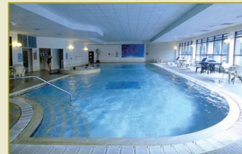
Pool - The Windlestrae